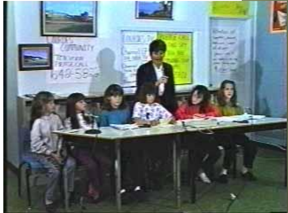
News readers, Lourdes Elementary